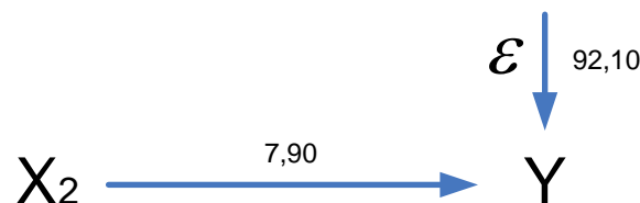
Picture 2. Individual Internal Factors Path Diagram Influencing Decision Making

The coefficient of determination, known as the squared number R, is used for calculation purposes. In this scenario it is equal to 0.079 or 7.90%, indicating that internal factors have a 7.90% impact on decision making. Conversely, 92.10% (100% - 7.90%) can be attributed to other factors.